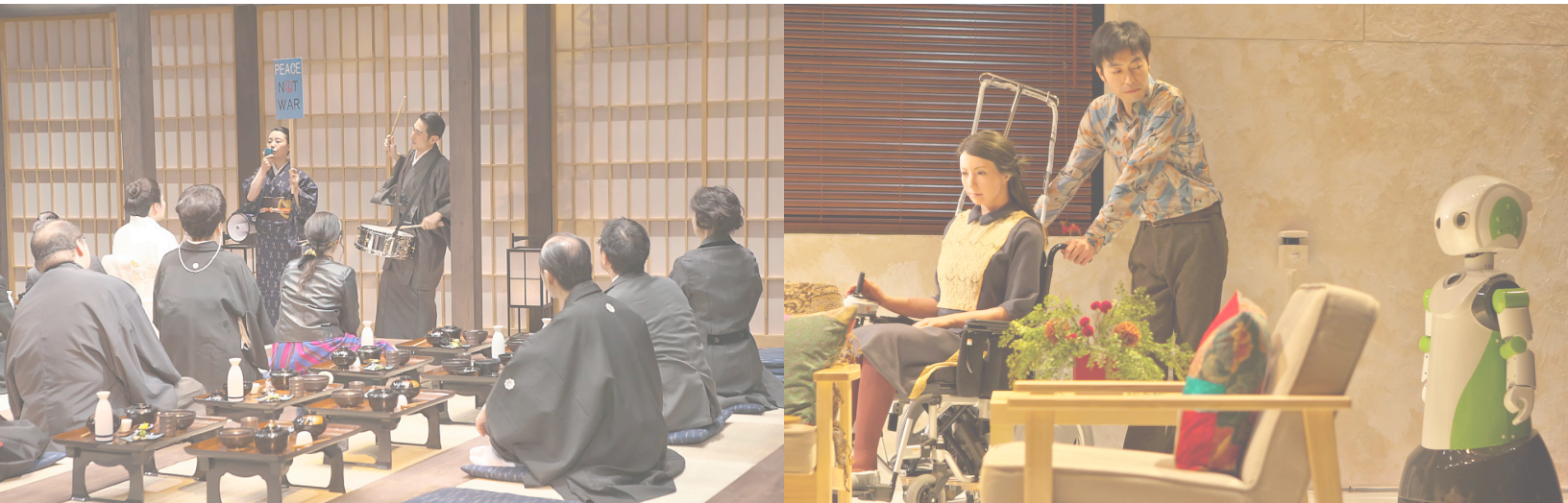
Scenes from "The Rise and Fall of Japanese Literature" and "Three Sisters"

“What is literature?” “What is modern?” “Can literature exist in Japan?”